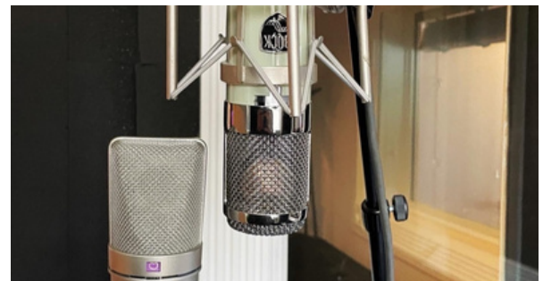
Variety of Microphones